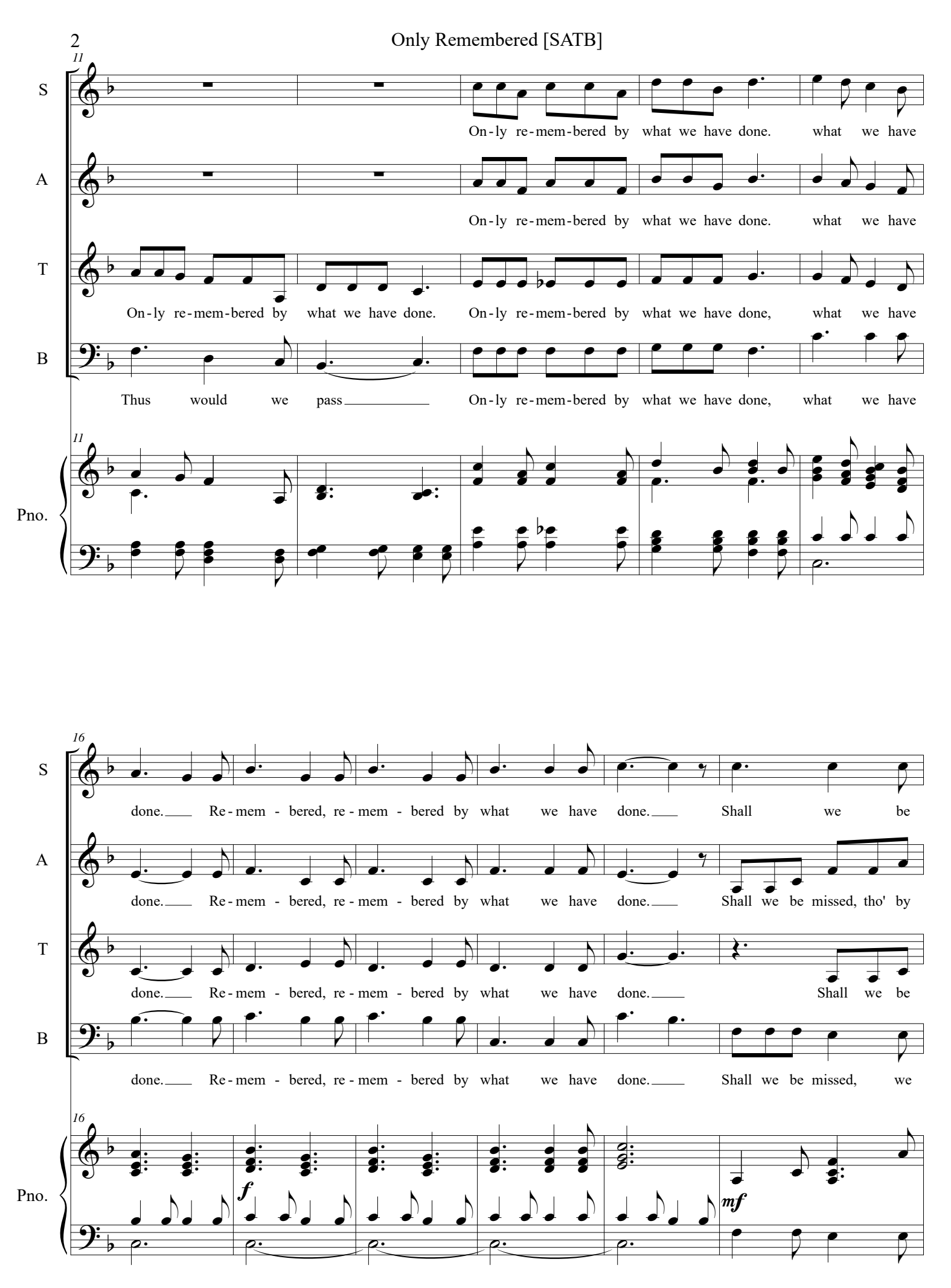
© 2019 Judy Lane, Oxford, England